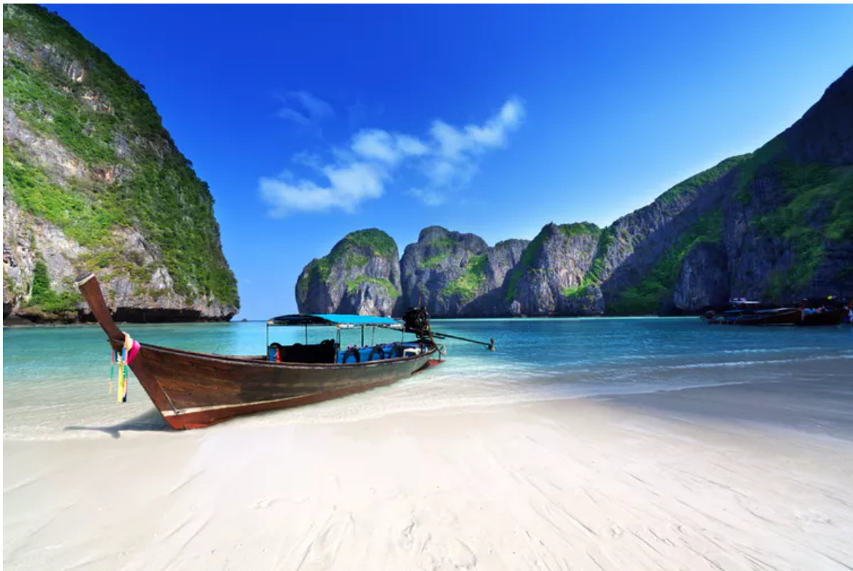
Up to 6,000 people were visiting Maya Bay every day before it was closed to tourists.

Excessive tourism, or over-tourism, in popular destinations can degrade heritage sites, the quality of life of host communities, and the experience of visitors. Virtual reality not only offers alternative forms of access to threatened locations, it also recreates historical experiences and provides virtual access to remote locations you might not make it to otherwise.