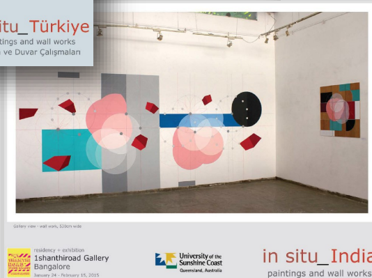
residency + exhibition 1shanthiroad Gallery Bangalore January 24 - February 15, 2015 University of the Sunshine Coast Queensland, Australia in situ_India paintings and wall works