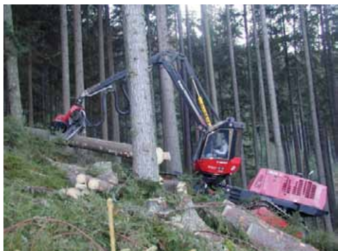
Figure 2. Valmet 911.3 harvester

Figure 2 shows a Valmet 911.3 harvester operating in steep terrain in Austria.