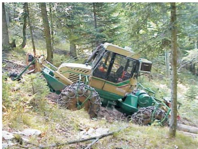
Figure 5. Woody 110 wheeled skidder in steep terrain (Slovenia) (Marence & Kosir, 2008)

Werner 1700 wheeled skidder: This wheeled skidder/forwarder has dual winches, and a planetary axle with a mounted hydraulic steering front axle. Both axles have limited-slip differentials for improved mobility and driving comfort in slopes. The 8.4 m reach boom is equipped with a grapple to extract bunched logs/trees and has an average productivity of 7–14 m 3 /PMH 0 (AUSTROFOMA, 2007).