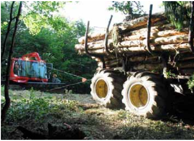
Figure 3. PistenBully connected to forwarder (Germany) (Bombosch et al., 2003)