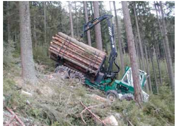
Figure 4. Gremo 950R cable-forwarder (Austria)