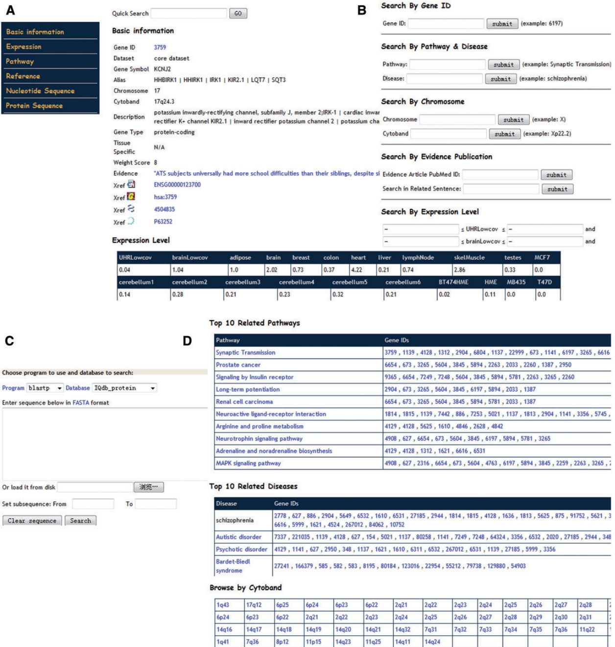
Figure 2. Web interface of IQdb. (A) The basic information in each IQ-associated gene page. (B) Query interface for text search. (C) BLAST search interface for comparing query against all sequences in IQdb. (D) Browser interface for genes in top 10 enriched pathways, top 10 enriched diseases and shared cyto band.

summary, IQdb is valuable in discovery of potential candidate genes, pathways and potential cross-talks between mental disorder and intelligence using comprehensive annotation and user-friendly interface. As a first effort to systematically collect and extend candidate IQ-associated genes, IQdb is also useful to better clarify the molecular mechanisms related to human intelligence.