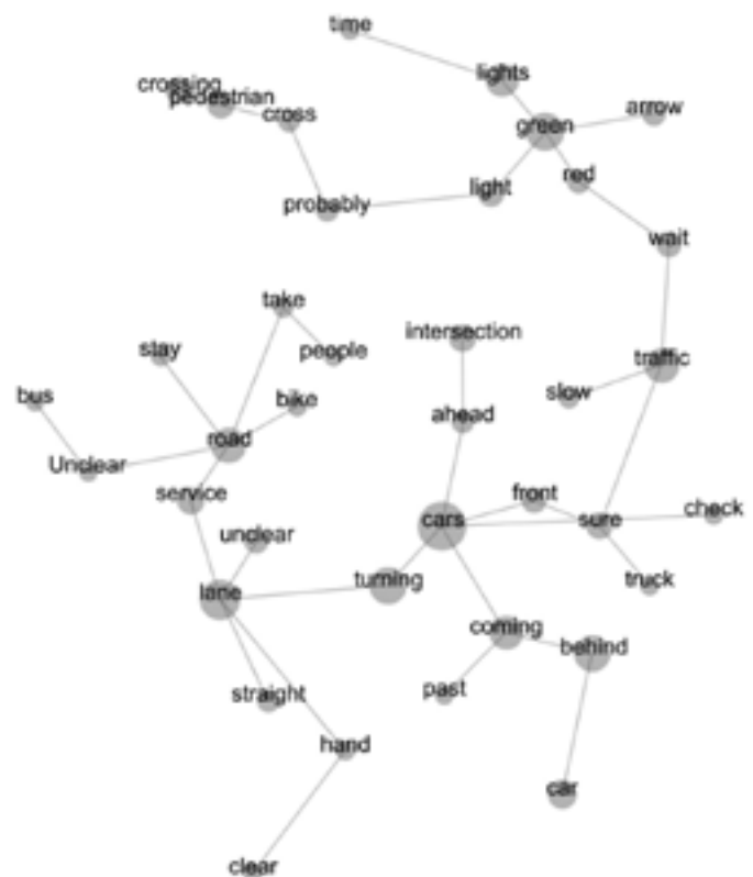
Figure 2. Overall cyclist situation awareness network for intersections

The overall situation awareness network presented in Figure 2 gives a generic summary of the composition of cyclist situation awareness at the intersections along the route. The network shows that there is a focus on traffic (e.g. 'cars') and its location and behaviour (e.g. 'behind', 'coming', 'turning'), on checking the traffic situation (e.g. 'check'), on the lights and their status (e.g. 'lights', 'green', 'red', 'arrow') and on the road environment (e.g. 'road', 'lane'). Notable concepts within the intersection network