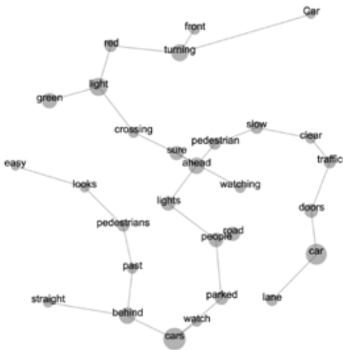
Figure 4. Overall cyclist situation awareness network for the shopping strip

The overall situation awareness network presented in Figure 4 gives a generic summary of the composition of cyclist situation awareness along the shopping strip. The network shows that the cyclists’ situation awareness along the shopping strip was markedly different to the intersections and arterial roads. Interesting features of situation awareness along the shopping strip include the presence of concepts relating to parked cars and their doors (e.g. ‘parked’, ‘doors’), which derives from the cyclists constant monitoring of the threat of car doors being opened directly in front of them, and also the presence of pedestrian-related concepts derived from their constant monitoring of pedestrians in and around the shopping strip.