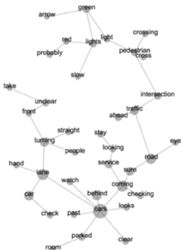
Figure 3. Overall cyclist situation awareness network for arterial roads

are ‘service’, which represents the service lane, ‘lane’, and ‘crossing’ which represents pedestrian crossings in and around the intersections. Further exploration of the verbal transcripts revealed that these concepts are derived from a major decision that cyclists face on approach to intersections regarding which path through the intersection they should take. Depending on traffic conditions, the intersection itself, and the perceived level of risk, cyclists can either turn right on the road within the flow of traffic, turn right via the pedestrian crossings and along the footpath, or turn right using a ‘hook’ turn whereby they proceed straight on through the intersection, join the traffic queue to the left hand side, and then wait for a green light and proceed straight through the intersection (achieving the originally desired right hand turn). Deciding which way to proceed through the intersection in the present study formed a major decision point for cyclists and incurred the need to assess the intersection itself, the traffic situation, and the level of perceived risk associated with each path through. Cyclist situation awareness on approach to intersections was found to be heavily focussed on information gathering for this decision. Notably, all three ways of passing through intersections for cyclists were observed during the study.